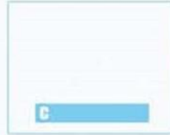
Leaderboard 90PX h x 728PX w

Home Page $225 Program Page $175 Show Page Advertiser $100