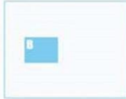
Medium Rectangle 250PX h x 300PX w

Home Page $250 Program Page Sponsor $200 Show Page Sponsor $150