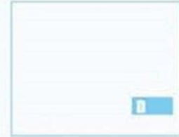
Sidebar Ad (Custom Size) 85PX h x 275PX w

Home Page $225 Program Page $175 Show Page Advertiser $100