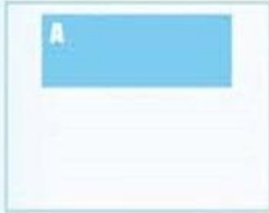
Flip Ad 300PX h x 730PX w

Home Page $250 Program Page Sponsor $200 Show Page Sponsor $150